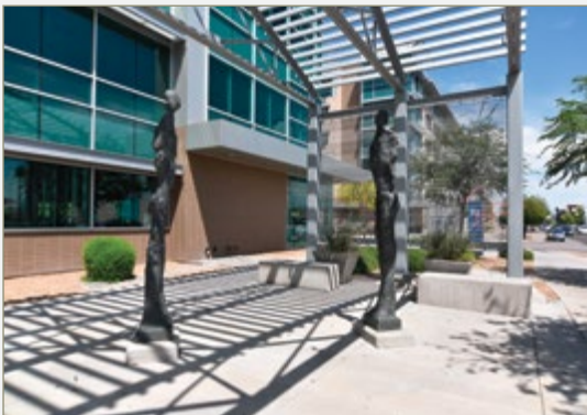
Art Sculptures Facing Seventh Avenue

Suite 110 8,891 SF Suite 200 (Full Floor Spec Suite) 24,123 SF Suite 300 24,123 SF