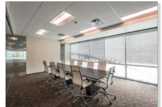
Conference Room in Second Floor Spec Suite